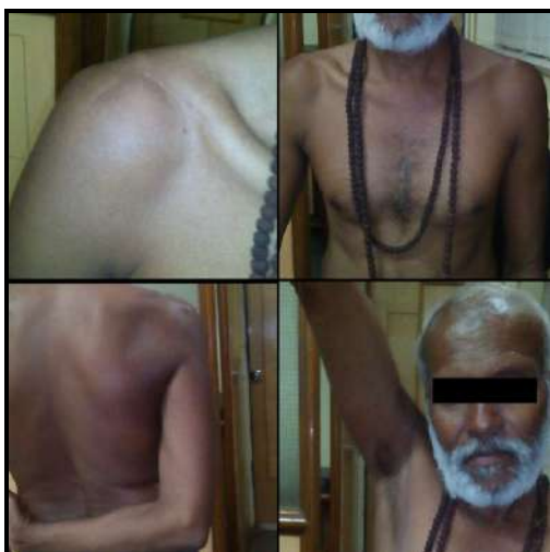
Figure-7: Clinical pictures after 6 weeks.