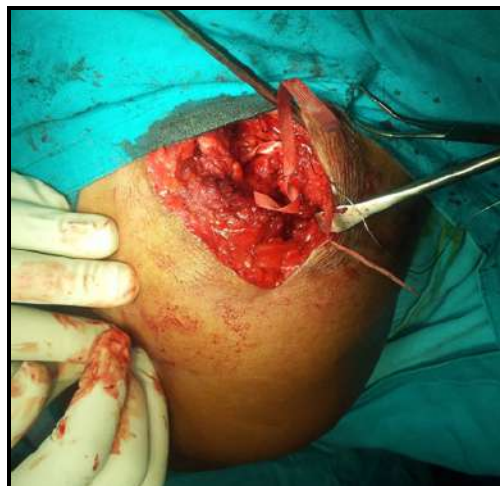
Figure-5: Mersilene tape passed under left coracoid process and then passed through the holes and tied over clavicle to correct superior displacement.