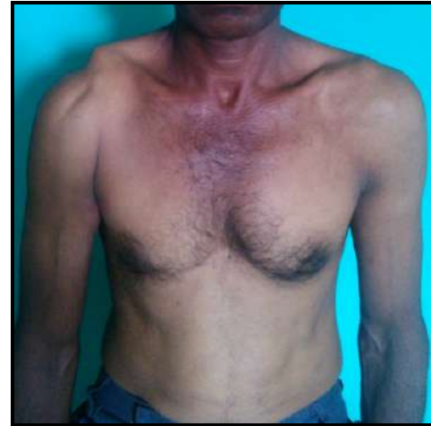
Figure-1: Clinical picture of right AC joint injury

Imaging: Imaging of the AC joint was done using anteroposterior view of the affected shoulder (fig. 2).