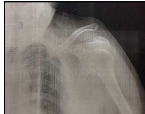
Figure-2: Plain radiograph of left shoulder joint in AP view showing grade V left AC joint injury.

Surgical technique: Under a suitable anaesthesia patient given supine position with a sand bag beneath the scapula of the operating side. Surgical marking done using a sterile surgical marker (fig. 3). Transverse incision taken over lateral 2/3 rd of clavicle extending upto the acromion lateral tip. Lateral end of clavicle exposed by elevating deltoid muscle subperiosteally and the acromioclavicular joint is exposed (fig. 4). Coracoid process is identified after blunt dissection. Two holes made in clavicle, one hole at conoid tubercle and one hole at trapezoid ridge. Mersilene tape passed under coracoid process and then passed through these holes and tied over clavicle to correct superior displacement and to replicate the anatomy (fig. 5). Two holes made on either